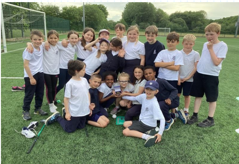
Well done to the year 4's who took part in a golf competition At St Bede's, then won a Sports Skills medal for their values, teamwork and positivity!