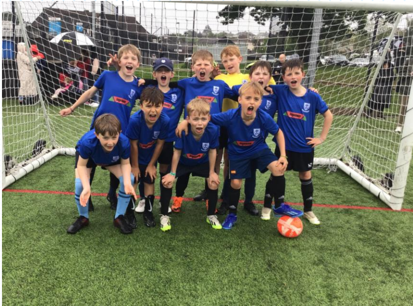
A massive well done to the boys football team for a great tournament and for being champion on the evening. They played 5 games and they won 4 and draw 1. They were unbeaten on the evening.