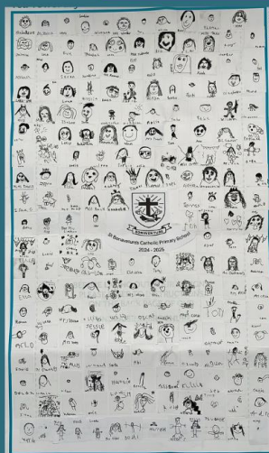
RECEPTION & KS1

THE CHILDREN HAVE BEEN BUSY DRAWING SELF-PORTRAITS FOR OUR VERY OWN ST BON'S TEA-TOWELS!